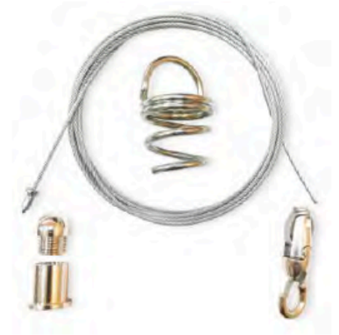
Shush Raft™ hanging kit

Our hanging kit includes spiral hook, 2m cable and eyelet hook.